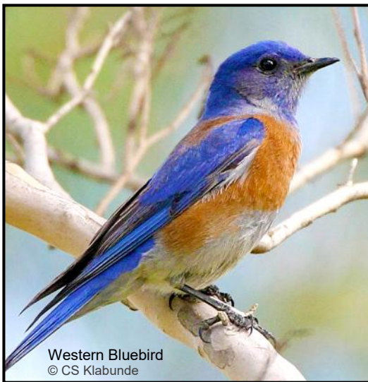
Western Bluebird

Come learn the basics of birdwatching and how to use a field guide and binoculars. Learn to ID the birds in your backyard and our local parks. A bird walk in the Conejo Community Park will follow.