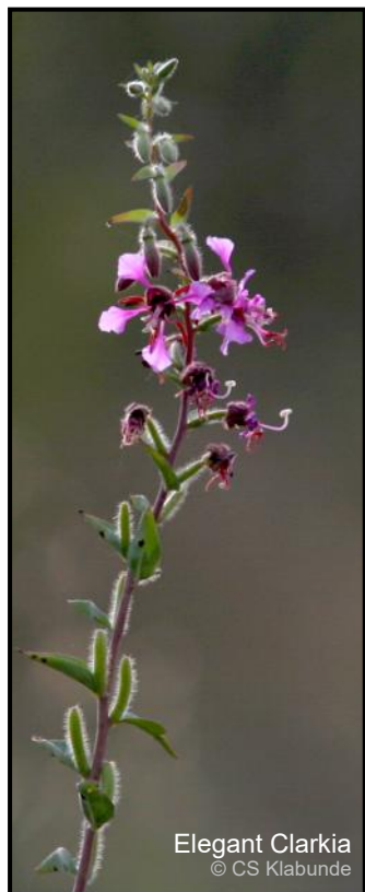
Elegant Clarkia © CS Klabunde

Apr 26, Sun, 9 am - 3 pm Bird-Friendly Garden Tour see page 3