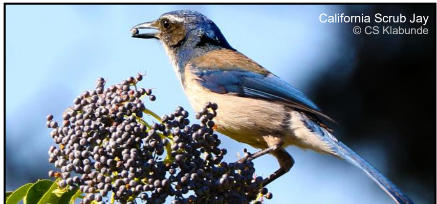
California Scrub Jay

Meet at 9 am, Lot B at Arroyo Vista Community Park, 4550 Tierra Rejada Road, Moorpark.