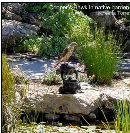
Cooper's Hawk in native garden

We hope that our Bird-Friendly Garden Tour will inspire you to install a bird-friendly habitat of your own.