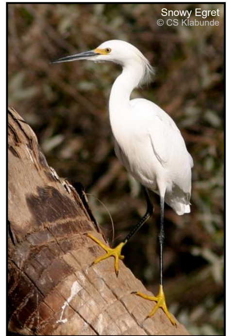
Snowy Egret

Meet at 8:00 am at the Conejo Valley Botanic Garden (CVBG), 400 W. Gainsborough Rd., Thousand Oaks. Drive to the parking lot on Jeanine Drive. Class will be held in the Kids' Adventure Garden. A $10 cash donation will be collected for CVBG. Bring water & snacks, wear comfortable shoes and binoculars if you have them. After this one class, you'll feel ready to join our regular schedule of birding trips. Look for them on our website.