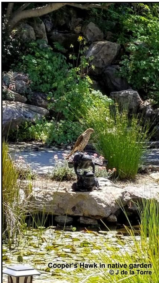
Cooper's Hawk in native garden

CVAS has a mission to make the public aware of the importance and beauty of birds, natural habitats, native plants and wildlife. At a time when bird populations are in decline due in large part to loss of habitat, we are dedicated toward promoting the creation of viable habitat for both local and migratory birds in our area. Our Bird-Friendly Garden Tours serve to educate and promote awareness about the importance of California native plants in supporting our bird populations, because native plants support the native bugs that birds feed to their babies. We encourage you to spread the word and bring your friends!