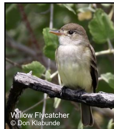
Willow Flycatcher