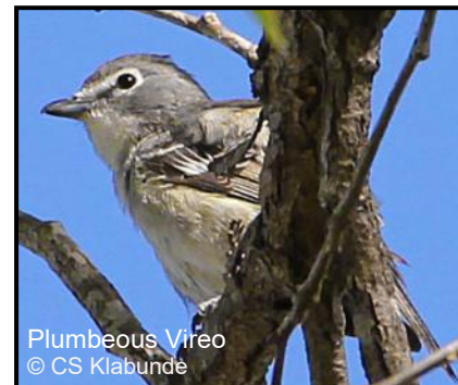
Plumebeous Vireo

Trip leader: David Person (805) 469-6806