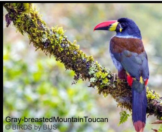
Gray-breasted Mountain Toucan

We are going to the Central Andes from December 6-14. The website to sign up is: