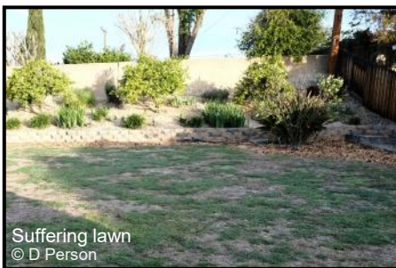
Suffering lawn