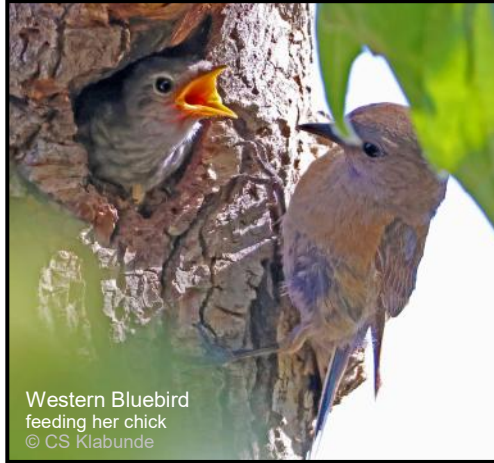
Western Bluebird feeding her chick