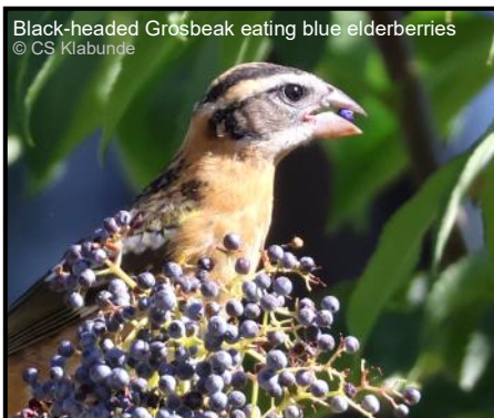
Black-headed Grosbeak eating blue elderberries

Do you have a lawn that's turning brown, or worse, artificial turf that's fading in the sun? Would you like to create a beautiful native garden that supports birds, pollinators, and other wildlife instead, while saving water and money? Starting June 1, we will be accepting applications for Conejo Valley Audubon Society's LAWNS TO HABITAT grant program, helping people turn their sad looking yards into thriving native plant habitats, resplendent with wildlife!