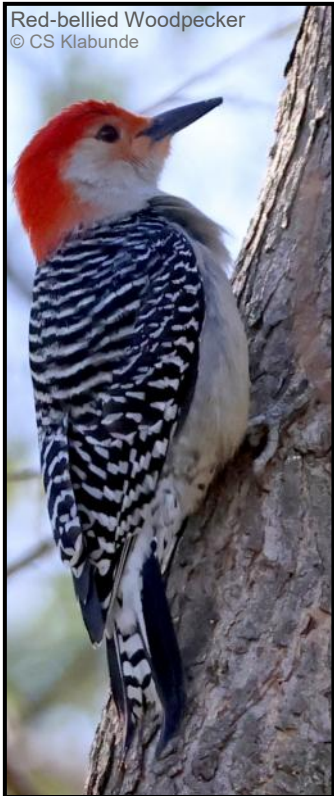
Red-bellied Woodpecker © CS Klabunde

Apr 26, Sat, 8:00 am Big Morongo see page 2