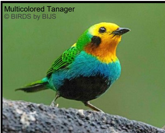
Multicolored Tanager