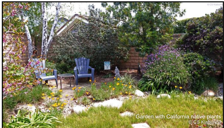
Garden with California native plants

Do you have a lawn that's turning brown, or worse, artificial turf that's fading in the sun? Would you like to create a beautiful native garden that supports birds, pollinators, and other wildlife instead, while saving water and money? Starting June 1, we will be accepting applications for Conejo Valley Audubon Society's LAWNS TO HABITAT grant program, helping people turn their sad looking yards into thriving native plant habitats, resplendent with wildlife!