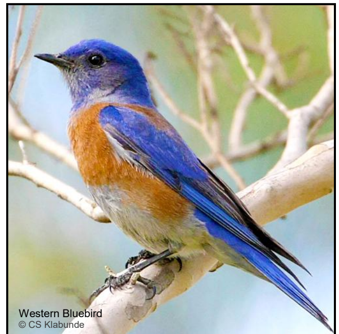
Western Bluebird

Spread the word to Beginner Birders! Three Saturday classes are scheduled for 8 am: May 31, June 7 and June 14. Learn the basics of birdwatching, field guides and your binoculars setup. Location details to be posted on website soon.