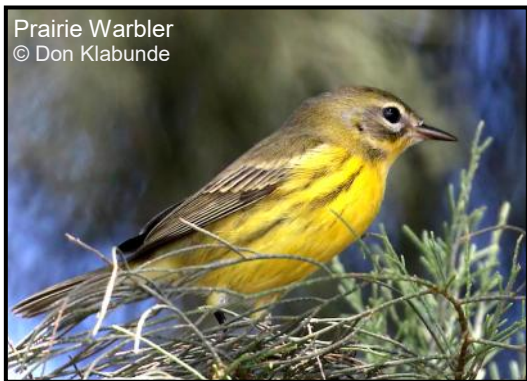
Prairie Warbler