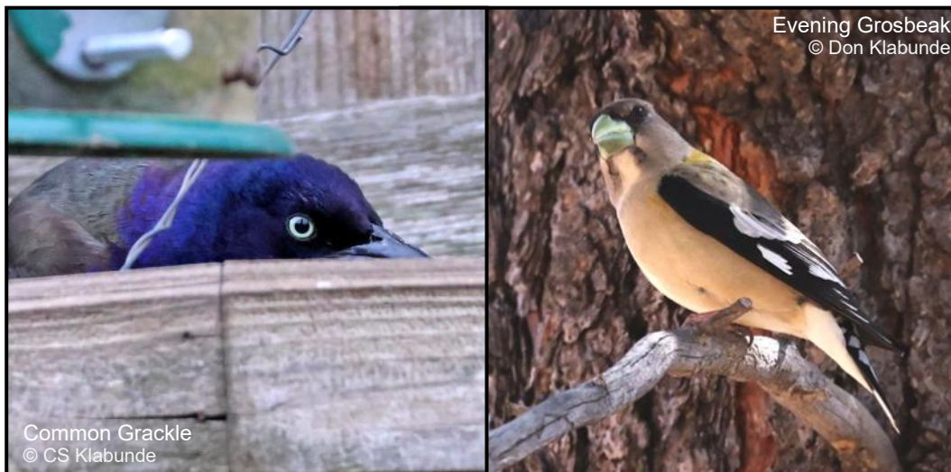
Common Grackle

On April 8th 2024, North America was treated to the spectacle of a total solar eclipse as the moon's shadow passed across the continent, from Mexico to Newfoundland. Many of us scurried to points along the path of totality. Some were greeted by clouds, but others got lucky and had beautiful clear skies. Don and Chrystal Klabunde were among the lucky. So, join us on April 7th as they present photos from a few birding hot spots along their cross-country drive to Indiana as well as Don's awesome photos of the 2024 total eclipse!