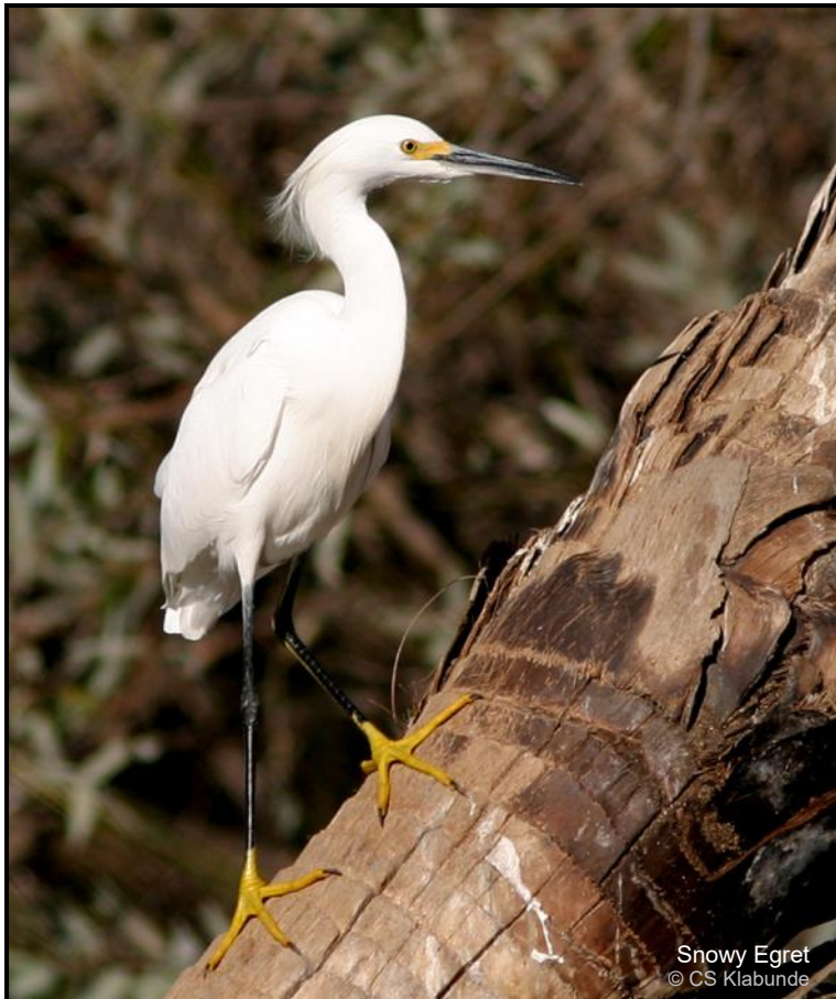
Snowy Egret

Spread the word to Beginner Birders! Three Saturday classes are scheduled for 8 am: May 31, June 7 and June 14. Learn the basics of birdwatching, field guides and your binoculars setup. Location details to be posted on website soon.