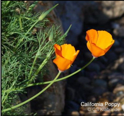
California Poppy

We hope our Bird-friendly Garden Tour will inspire you to install a bird-friendly habitat of your own, and we encourage you to spread the word and bring your friends!