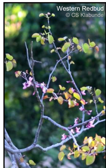
Western Redbud