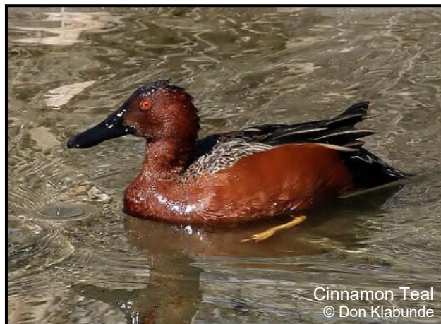
Cinnamon Teal