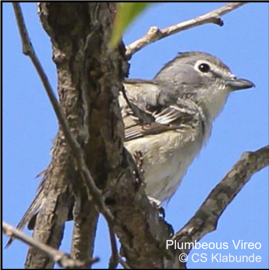
Plumbeous Vireo

Please bring water, wear comfortable shoes, a hat, and observe good birding etiquette. RAIN CANCELS