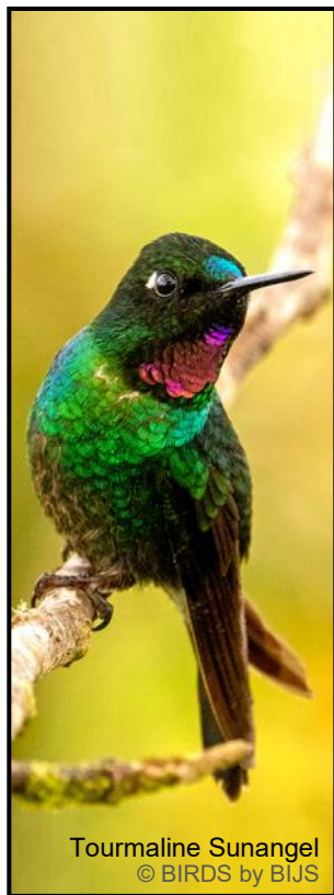
Tourmaline Sunangel

Dec 28, Sat, 8:00 am Los Robles Open Space see page 2