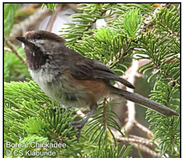
Boreal Chickadee © CS Klabunde

We may try and split rental cars/lodging to reduce costs. Group size will be limited to 8-10 people. If interested, please contact Sammy Cowell at (818) 470-7098 or fieldtrips@conejovalleyaudubon.org