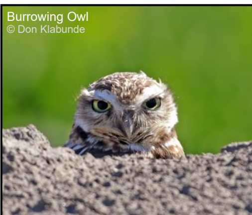
Burrowing Owl

Thousand Oaks Botanic Garden, Los Robles Golf Course, Hill Canyon, Wildwood Park, Calleguas Creek, Revelon Slough, the eastern Oxnard Plain, Hidden Valley, Satwiwa, and many other areas around Camarillo and Thousand Oaks. Online registration will not be available this year so please contact me directly at pereksta@pacbell.net .