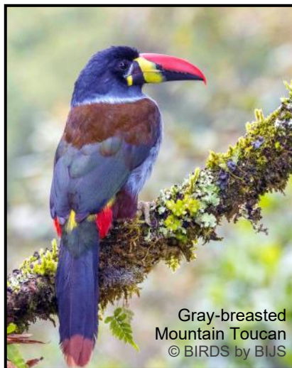
Gray-breasted Mountain Toucan

Get ready for a dive into South America's birdiest country! Together we'll explore Colombia's unique ecology, breathtaking scenery, and unparalleled avian diversity! Colombia holds the record with nearly 2,000 bird species and an impressive 80 endemics!