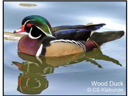
Wood Duck

This is our 49th CBC, and we're hoping to top last year's count of 195 species and over 23,000 individuals! We hope to do even better this year but need CVAS members to close out the year right by getting up early and being ready to bird. As always, we will cover the area from Westlake to the Oxnard Plain, and from Leo Carrillo State Park to California Lutheran University in Thousand Oaks. Areas within our circle include the Santa Monica Mountains, La Jolla Canyon, Big Sycamore Canyon, Leo Carrillo State Park, Camarillo Regional Park, the CSU Channel Islands campus, Mugu Lagoon, Camarillo Springs Park,