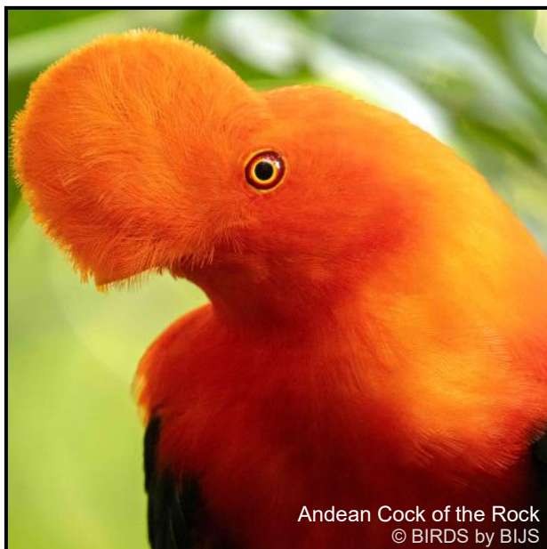
Andean Cock of the Rock