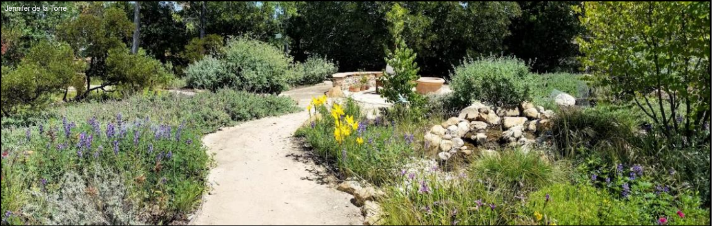
Jennifer de la Torre

Please join us. Our tour will feature yards which provide habitat for our native birds and demonstrate the use of drought tolerant California native plants in the landscape. Gardens will be located in Oak Park, Agoura, Simi Valley, Thousand Oaks, Newbury Park, Camarillo and Ventura. Hosts will be on site to answer questions. Please visit the gardens in the order of your choice.