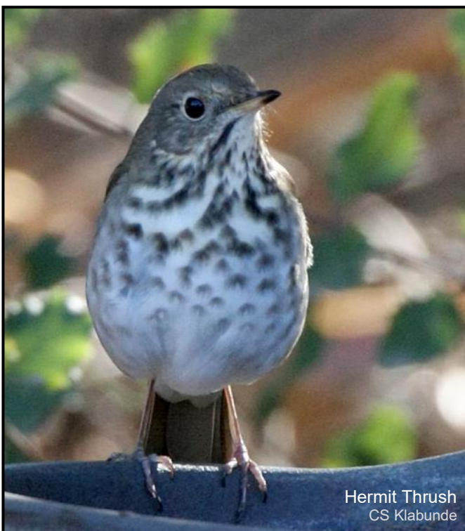
Hermit Thrush

Pricing: $280 for WFVZ Members, $400 for Non-Members. Register Here