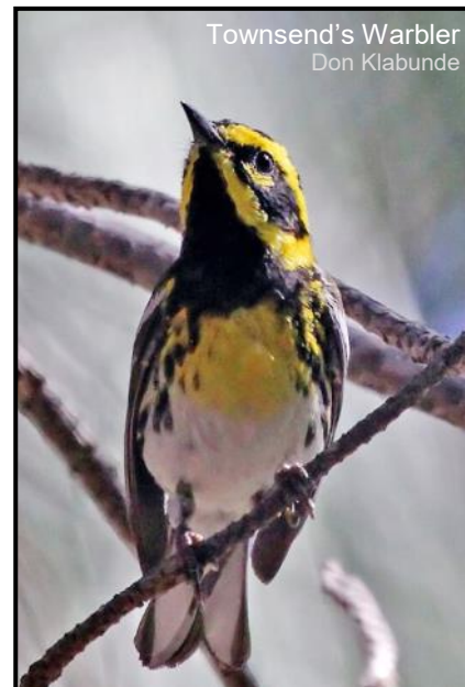
Townsend's Warbler Don Klabunde

April 29, Saturday - Matilija Riparian area , Matthew Page (805) 990-6534. Meet at 8:00 am. Due to flood damage, the road is limited to residents only, so park on Matilija Canyon Rd. (Forest Rt. 5N13) just as it comes off Hwy 33. From there, the group will walk up to the Matilija overlook and down the road to access the riparian forest. This can be a difficult excursion for some, so bring proper hiking gear, sunscreen, and plenty of water.