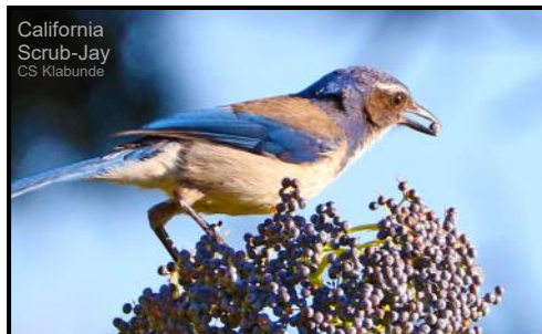
California Scrub-Jay CS Klabunde