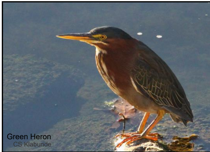
Green Heron CS Klabunde

To be arranged. Check with Dee Lyon at (805) 427-0987.