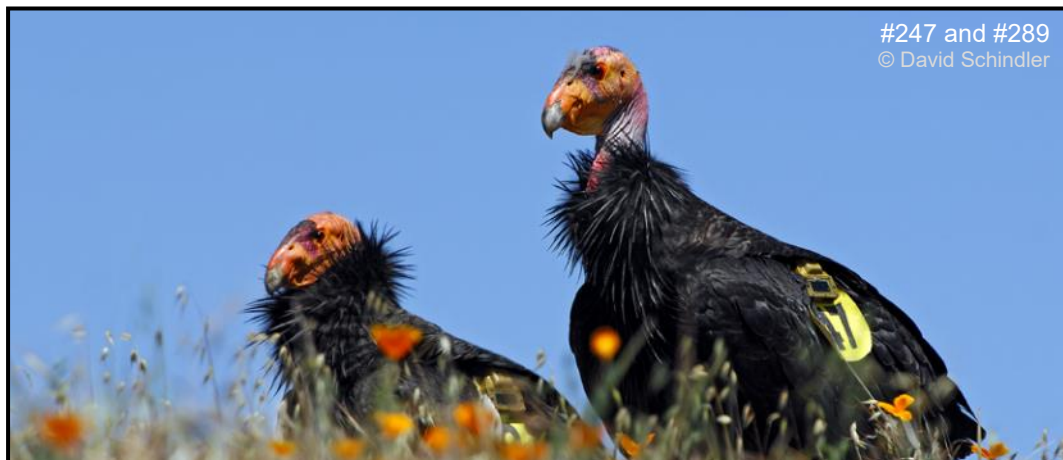
#247 and #289