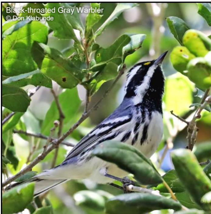
Black-throated Gray Warbler