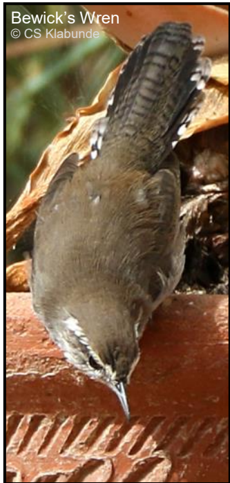
Bewick's Wren

Oct 28, Sat, 8:00 am Lake Piru see page 2