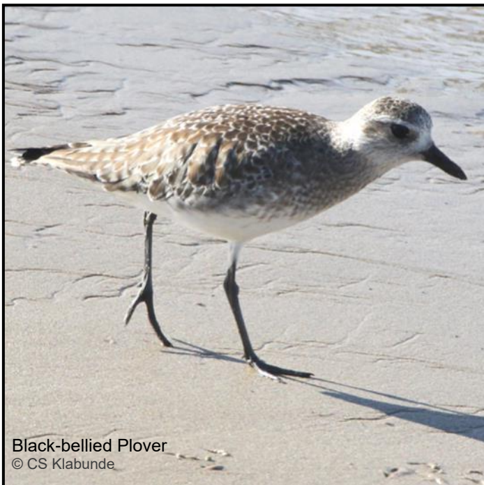
Black-bellied Plover

Pandemic restrictions have been lifted, but CVAS will continue its careful approach to birding trips. Masks will no longer be required for outdoor events, but we may not be offering extra binoculars to share, so please bring your own. And finally, please bring water, wear comfortable shoes, a hat, and observe good birding etiquette. RAIN CANCELS