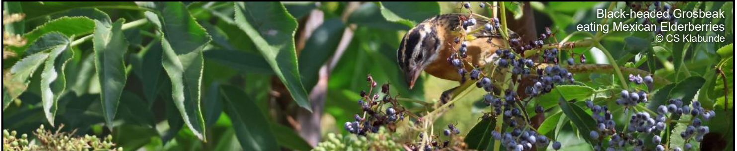
Black-headed Grosbeak eating Mexican Elderberries

As fall arrives, the weather begins to cool and the rainy season approaches, we contemplate planting California natives that will attract birds to our yards. But where to start?