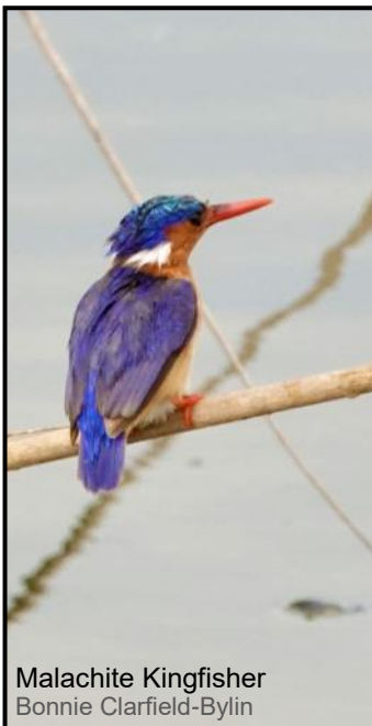
Malachite Kingfisher

Jan 28, Sat, 8:00 am Lake Casitas See page 2