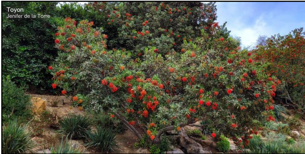
Toyon Jennifer de la Torre

https://calscape.org/Heteromeles-arbutifolia-(Toyon)