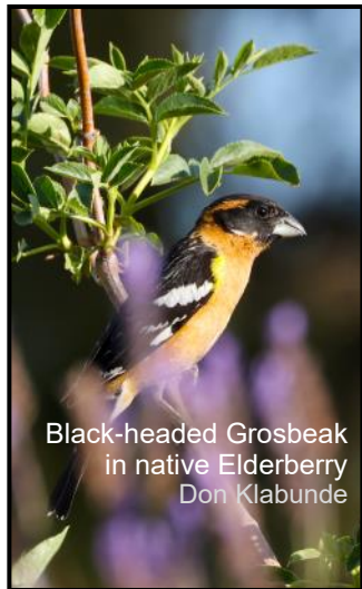
Black-headed Grosbeak in native Elderberry Don Klabunde

Apr 30, Sat, 9:00 Wheeler Gorge see page 2