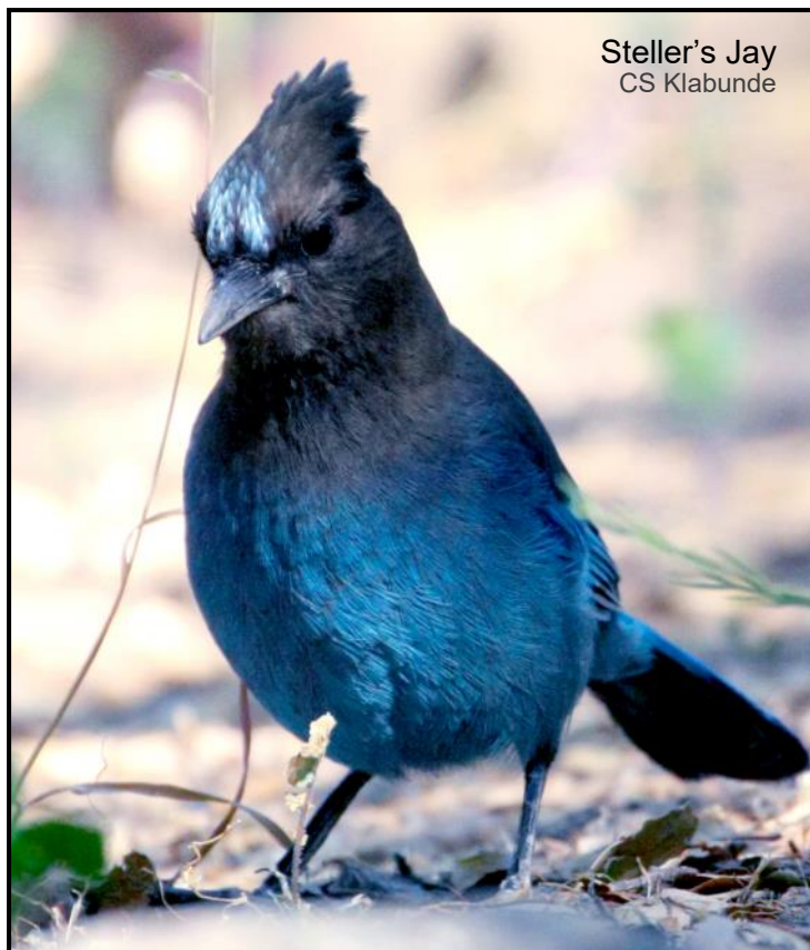
Steller's Jay