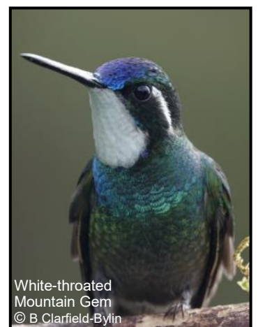
White-throated Mountain Gem