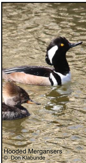
Hooded Mergansers