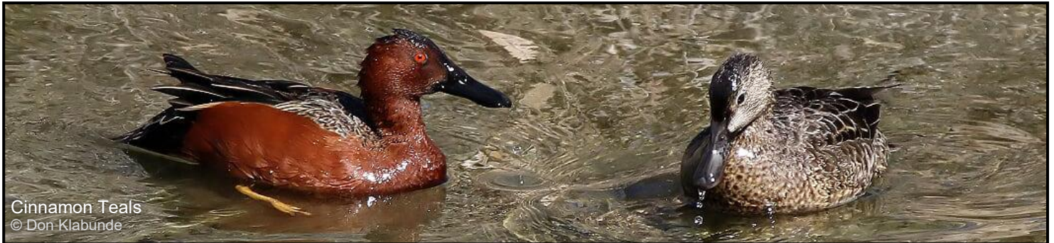
Cinnamon Teals

If you are looking for a way to contribute to understanding the status of wintering birds in North America, please join us for the National Audubon Society's 124th annual Christmas Bird Count (CBC) on Sunday December 17, 2023, and help cover the Conejo Valley Audubon Society's "Thousand Oaks" CBC circle.