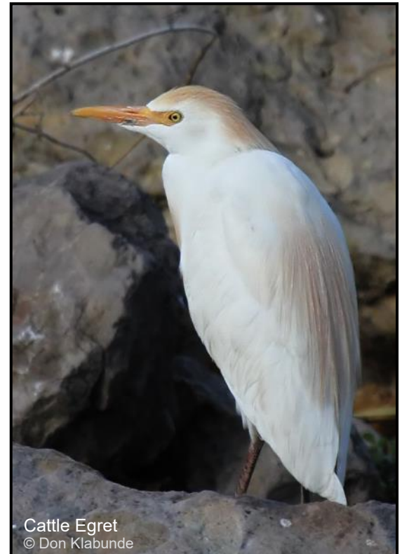
Cattle Egret

of all skill levels. If you do not wish to go out and count birds, consider "feeder watching" in your back yard. You might attract an unusual hummingbird to your feeder, find an uncommon sparrow or finch, or keep an oriole around for us to include.