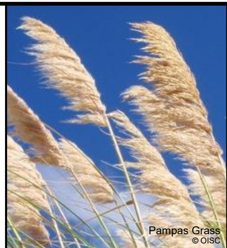
Pampas Grass

Remember, the best time to trim your trees is between now and January 31st. Not trimming trees during nesting season is one of the best way to promote a healthy bird population!