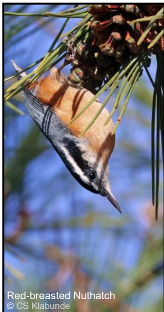
Red-breasted Nuthatch

Dec 30, Sat, all day Ventura CBC see page 2