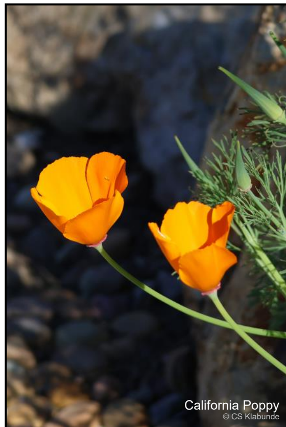
California Poppy