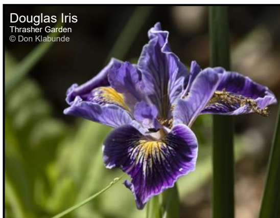
Douglas Iris Thrasher Garden