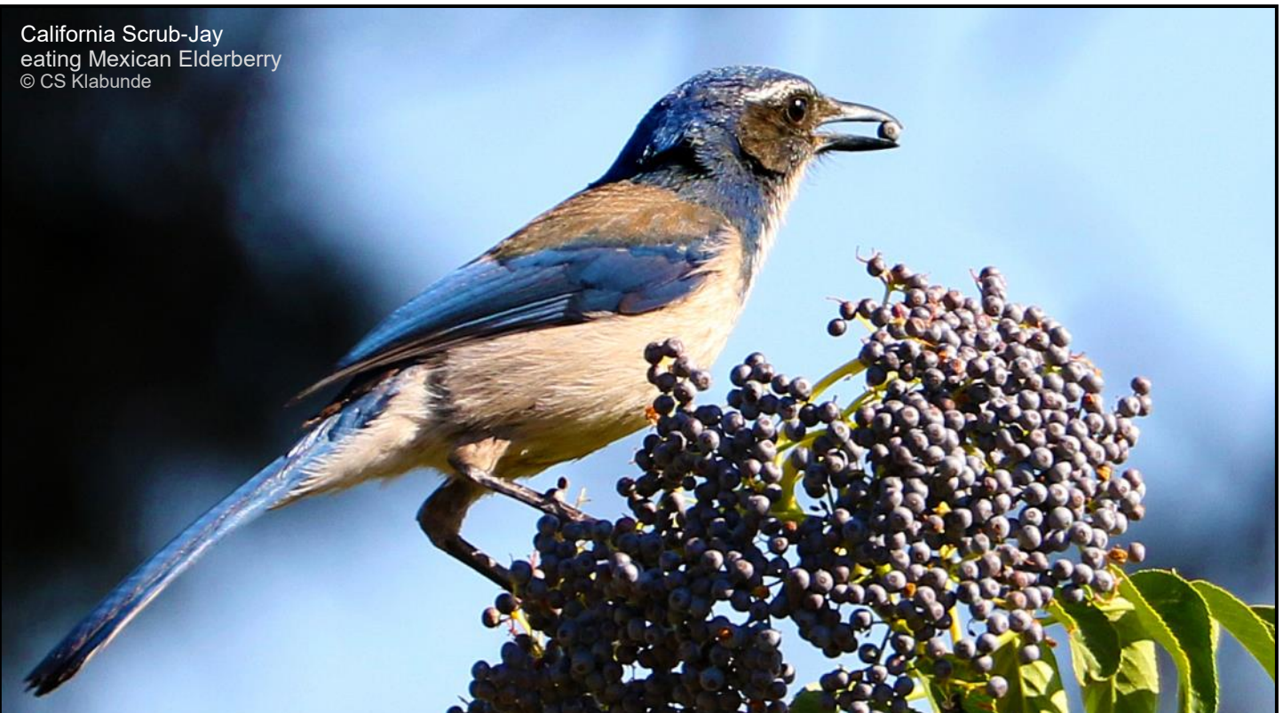
California Scrub-Jay eating Mexican Elderberry

Disclaimer: Everyone is welcome to attend any Conejo Valley Audubon field trip, but Conejo Valley Audubon Society assumes no responsibility for injuries, personal or otherwise, incurred while attending a CVAS sponsored activity and in order to attend, all attendees agree that CVAS is not liable for such accidents. Everyone attends at their own risk.