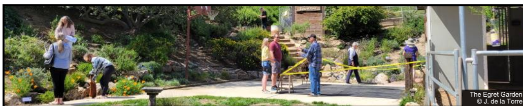
The Egret Garden