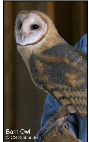
Barn Owl

June 17, 24 and July 1 - Beginner birding classes: The first class meets at 8 am at Conejo Valley Botanic Garden. Interested in learning more about birds, but not sure where or how to start? Join us as we go over the basics of birdwatching, become familiar with field guides, binoculars and other equipment, and learn the local birds in the area! Suitable for all ages! Hilly terrain.