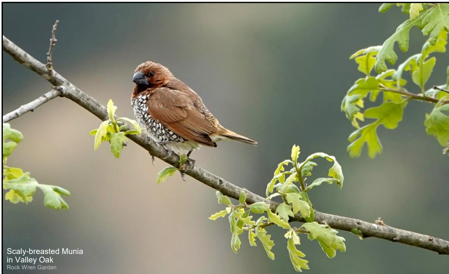
Scaly-breasted Munia in Valley Oak Rock Wren Garden