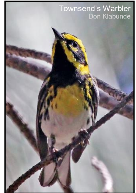
Townsend's Warbler Don Klabunde

April 29, Saturday - Matilija Riparian area , Matthew Page (805) 990-6534. Meet at 8:00 am. Due to flood damage, the road is limited to residents only, so park on Matilija Canyon Rd. (Forest Rt. 5N13) just as it comes off Hwy 33. From there, the group will walk up to the Matilija overlook and down the road to access the riparian forest. This can be a difficult excursion for some, so bring proper hiking gear, sunscreen, and plenty of water.