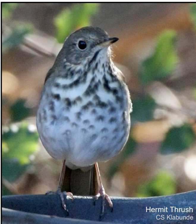
Hermit Thrush

Pricing: $280 for WFVZ Members, $400 for Non-Members. Register Here