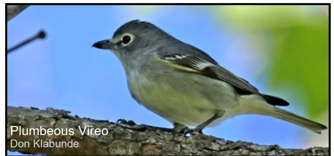
Plumbeous Vireo