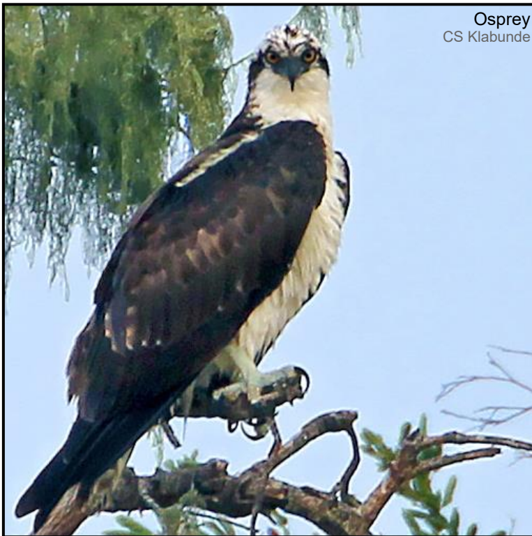
Osprey CS Klabunde