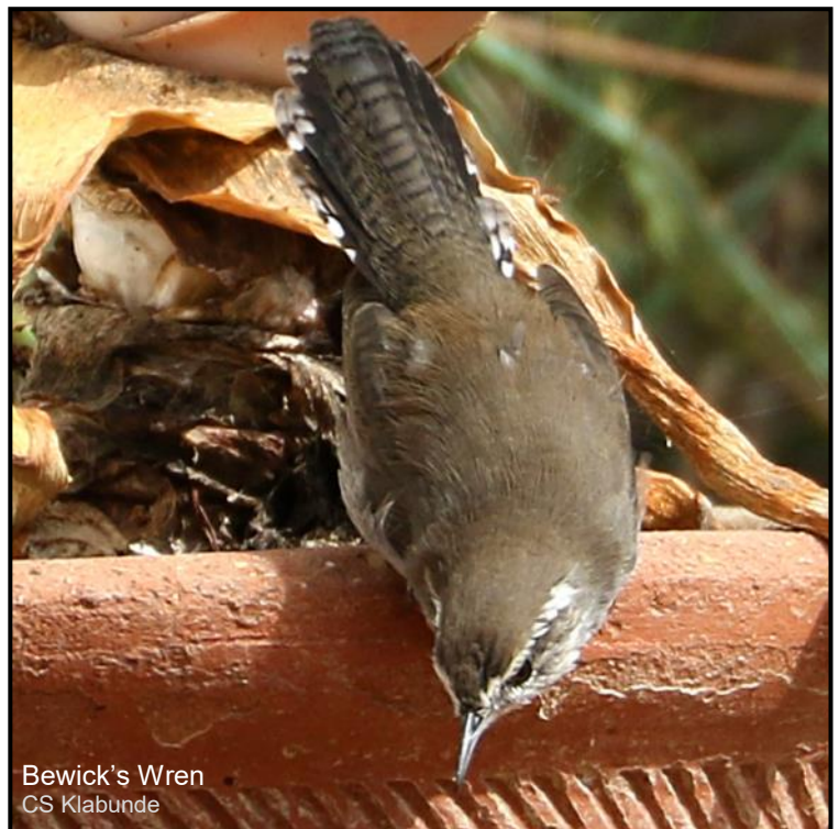
Bewick's Wren CS Klabunde