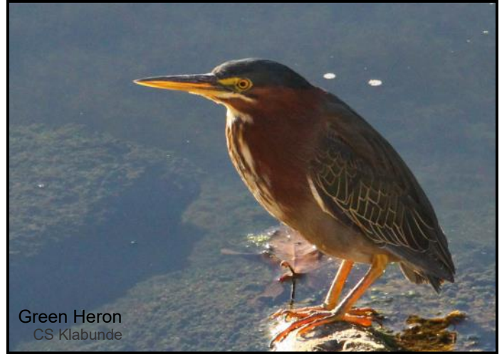
Green Heron CS Klabunde

To be arranged. Check with Dee Lyon at (805) 427-0987.