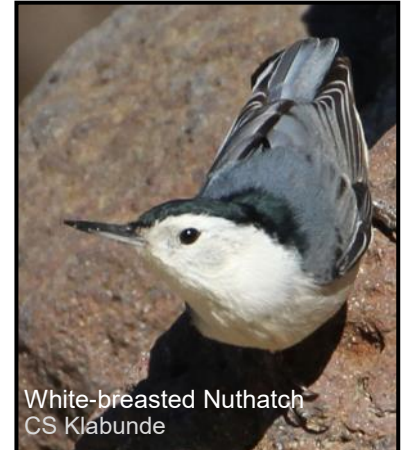
White-breasted Nuthatch CS Klabunde

Meet at 8 am at the main parking lot off Lynn Rd. We'll look for chaparral and grassland birds. Leader is Richard Armerding - (310) 701-3878