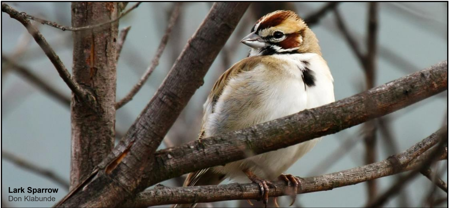
Lark Sparrow Don Klabunde