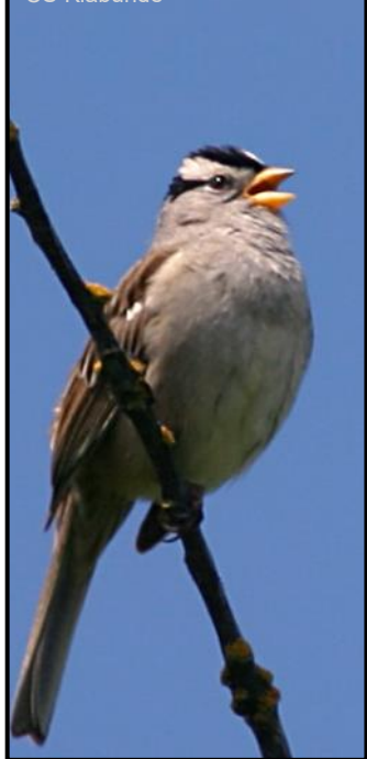
White-crowned Sparrow CS Klabunde

Nov 26, Sat, 8:00 am Rancho Sierra Vista see page 2