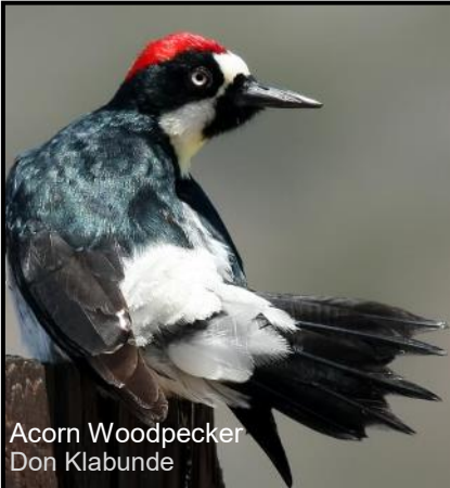
Acorn Woodpecker Don Klabunde

Since we're still living with some degree of pandemic concerns, CVAS will continue its careful approach to birding trips. Masks will no longer be required for outdoor events , but we won't be offering extra binoculars to share, so please bring your own. And finally, please bring water, wear comfortable shoes and observe social distancing . RAIN CANCELS