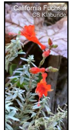
California Fuchsia CS Klabunde

One such native that affords a fabulous pop of color in the late summer and into the fall is California Fuchsia, Zauchneria californica (AKA Epilobium canum ).