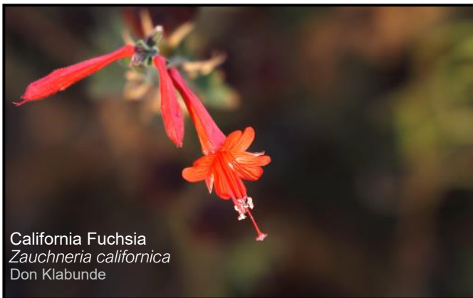
California Fuchsia Zauchneria californica Don Klabunde

Fall is a perfect time to start thinking about landscape renovations, or simply adding or replacing plants in your current landscape. Year round color and interest makes our yards so much more inviting, not only to us, but to our avian friends. In order to get the most bang for your buck, nice plants that are visually appealing AND useful for our native birds, why not consider planting California natives that are appropriate for your area?