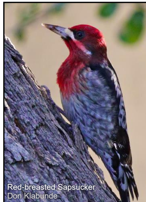
Red-breasted Sapsucker Don Klabunde

Contact Dee Lyon ASAP - 805-427-0987 to get your info submitted to the Navy.