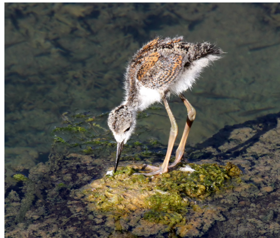
Black-necked Stilt juvenile