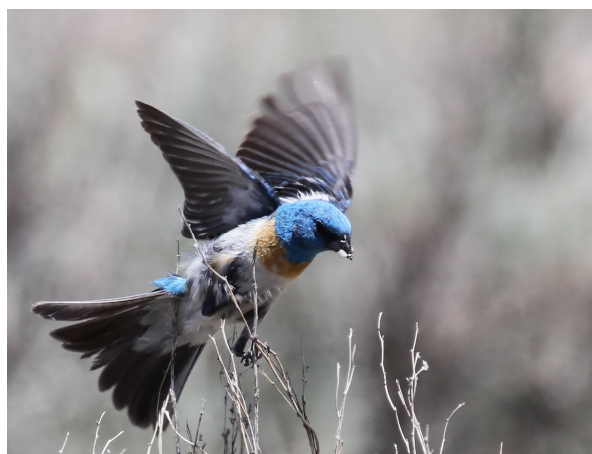
Lazuli Bunting by Don Klabunde