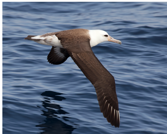
Laysan Albatross