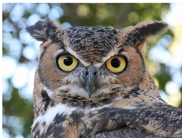
Great-horned Owl by Don Klabunde