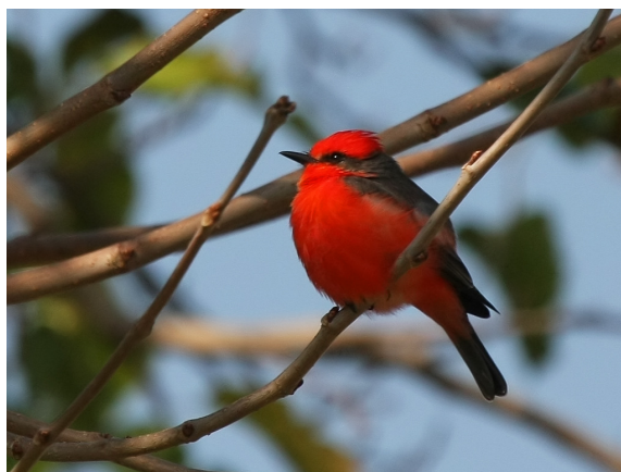
Vermilion Flycatcher

The editor would appreciate any articles of interest, photographs or field trip reports from members. Please give them to me by the 5 th of the month with articles in plain text and pictures in JPEG format. (newsletter@conejovalleyaudubon.org)