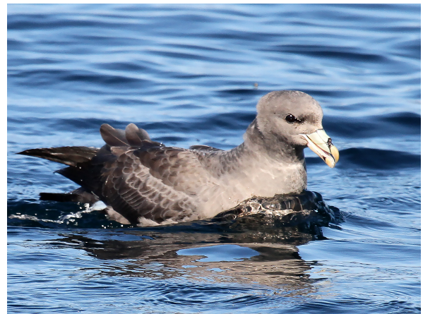
Northern Fulmar