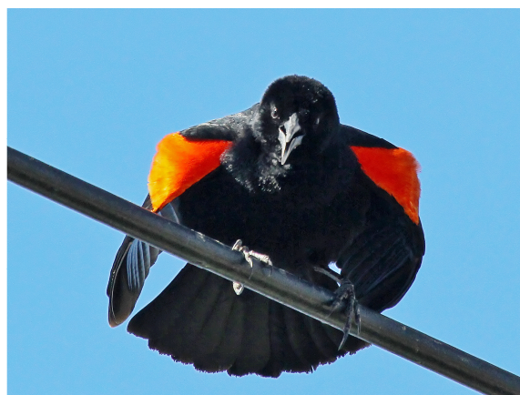
Red-winged Blackbird by Don Klabunde