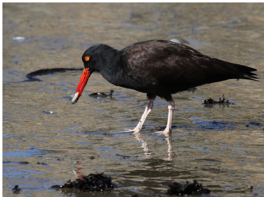
Black Oystercatcher by Don Klabunde