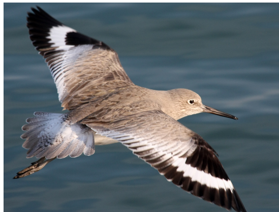
Willet