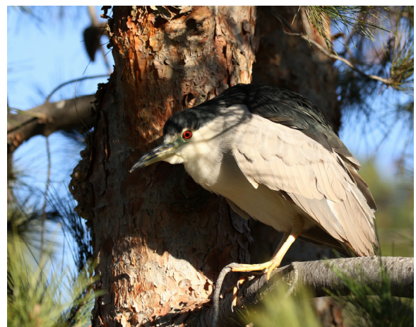
Black-crowned Night Heron by Don Klabunde