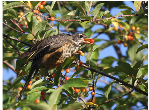
American Robin