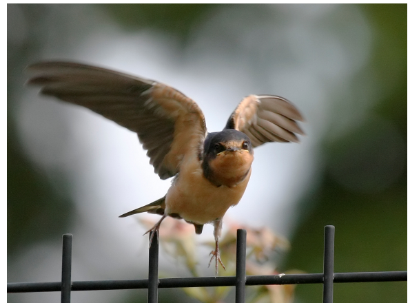
Barn Swallow by Don Klabunde