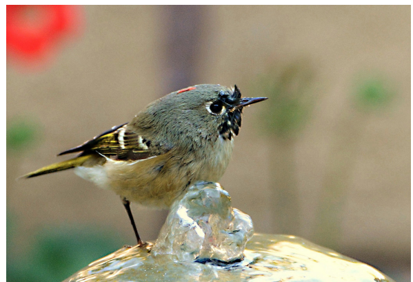
Ruby-Crowned Kinglet