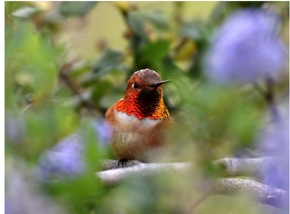
Rufous Hummingbird by Don Klabunde