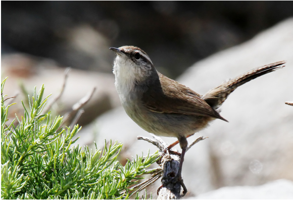
Bewick's Wren