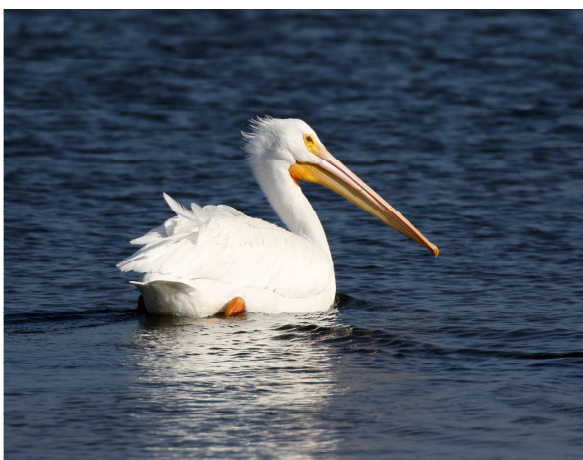
White Pelican by Don Klabunde