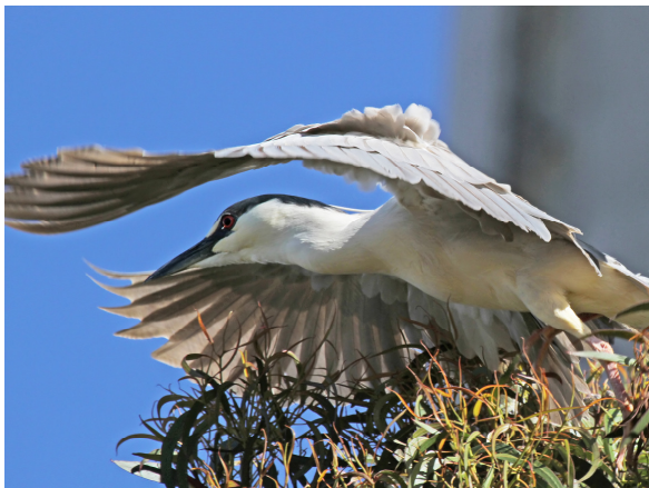
Black-crowned Night Heron by Don Klabunde