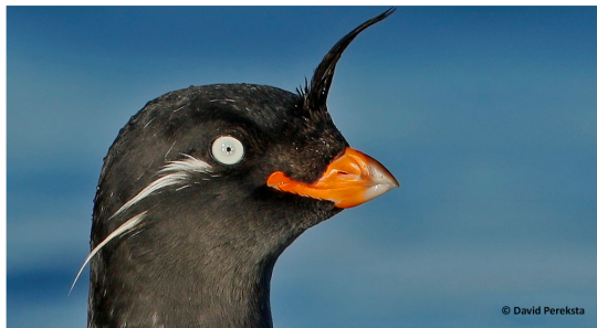
Crested Auklet

Russian Far East: Birding in a Sea of Sorrow