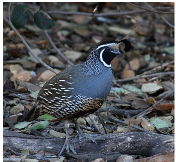
California Quail