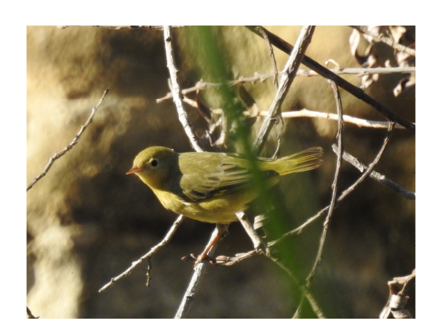
Yellow Warbler by David Plotkin

Malibu Lagoon features channels, open river and coastline. We can expect to see waterfowl, grebes, loons, gulls, terns and shorebirds. We will also see sparrows, wrens, warblers and flycatchers. Expect as many as 60-70 species, with good weather and good luck. Carpool from Rancho Park & Ride in Thousand Oaks at 7:15 am or meet outside the lagoon on PCH at 8 am. Trip leader: Ron Barns 818-991-9967