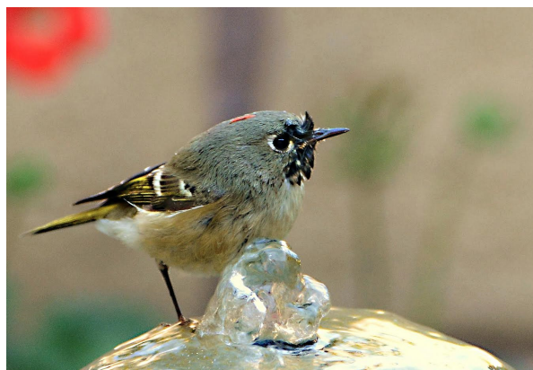
Ruby-crowned Kinglet