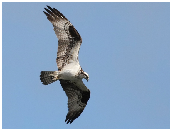
Osprey

The editor would appreciate any articles of interest, photographs and field trip reports from members. Please give them to me by the 5 th of the month with articles in plain text and pictures in JPEG format. (newsletter@conejovalleyaububon.org)