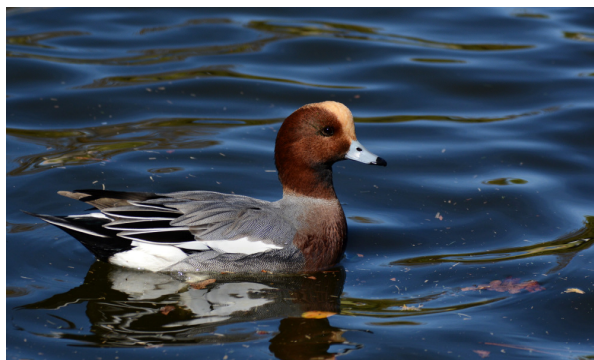
Eurasian Wigeon