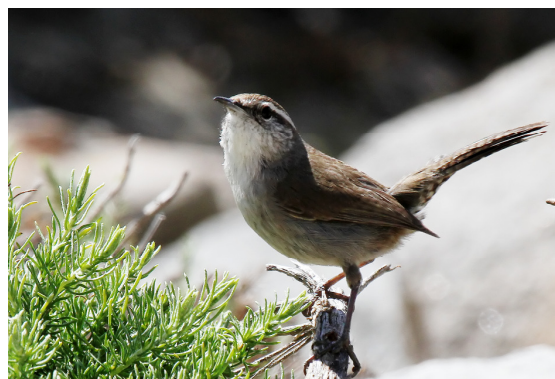
Bewick's Wren