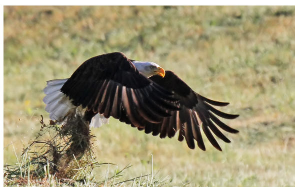
Bald Eagle by Don Klabunde