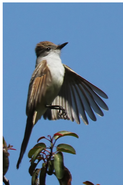
Ash-throated Flycatcher