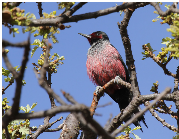
Lewis's Woodpecker by Don Klabunde

Needed! Front Yard to convert to Habitat. We provide plants, people to plant and chips for mulch. Contact Dee Lyon. 805-499-2165