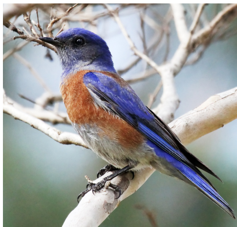
Western Bluebird by Don Klabunde