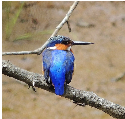
Madagascar Malachite Kingfisher