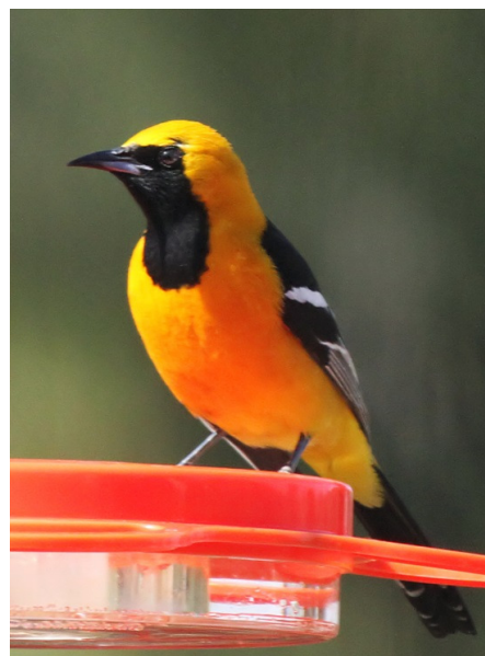
Hooded Oriole by Don Klabunde