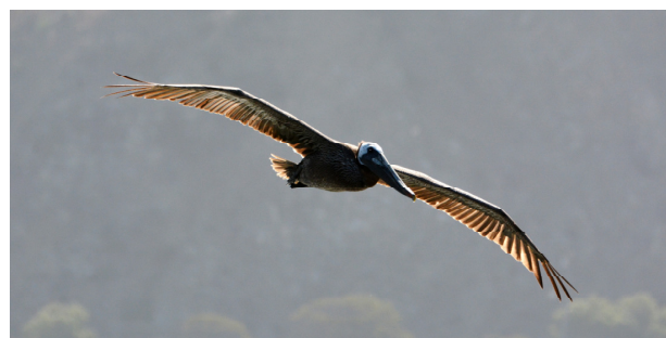
Brown Pelican