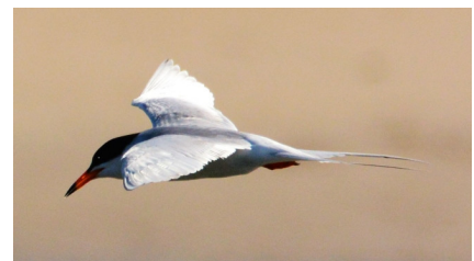
Caspian Tern