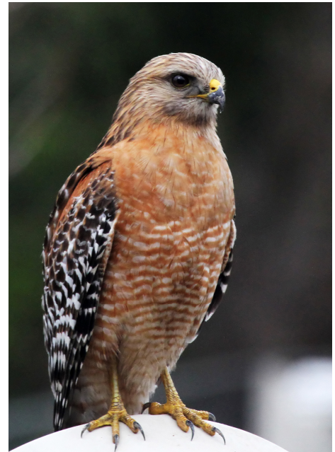
Red-shouldered Hawk by Don Klabunde