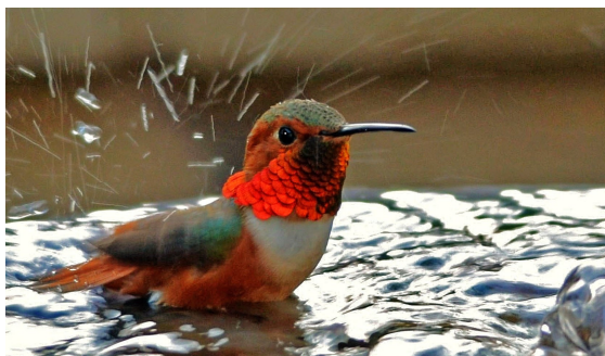
A Hummer in my Fountain