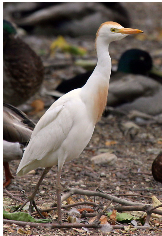
Cattle Egret by Don Klabunde