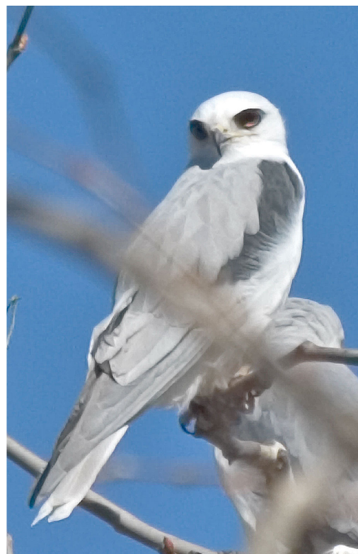
White-tailed Kite by Don Klabunde

The editor would appreciate any articles of interest, photographs or field trip reports from members. Send them to GaryE@ConejoValleyAudubon.org by the 5 th of the month. I prefer them in electronic form with articles in plain text or rich text format (RTF) and pictures in jpeg format.