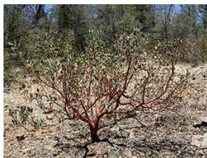
Manzanita Bush