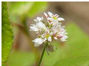
Buckwheat