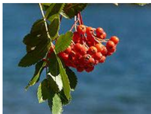
Tonyon Berries / Wiki