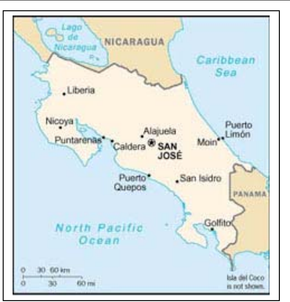
Map of Costa Rica

Mugu Rock Pre meeting Dinner: Ottavio's Western Foundation Pt. Mugu – U.S. Navy Base Beginner's Bird Walk Ahmanson Ranch Fillmore Area Hotspots Thousand Oaks Botanical Garden