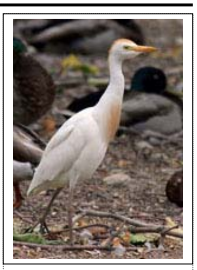
A breeding adult Cattle Egret displaying orange-buff plumes on crown & foreneck