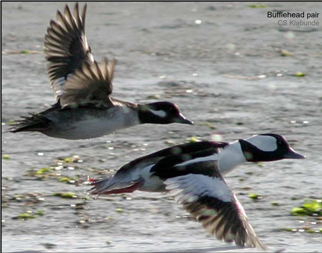
Bufflehead pair

In December it looked like the Migratory Bird Treaty Act (MBTA) might actually survive the past administration intact. Such was not the case, unfortunately. To quote natlawreview.com: “On 7 January 2021, the Trump administration