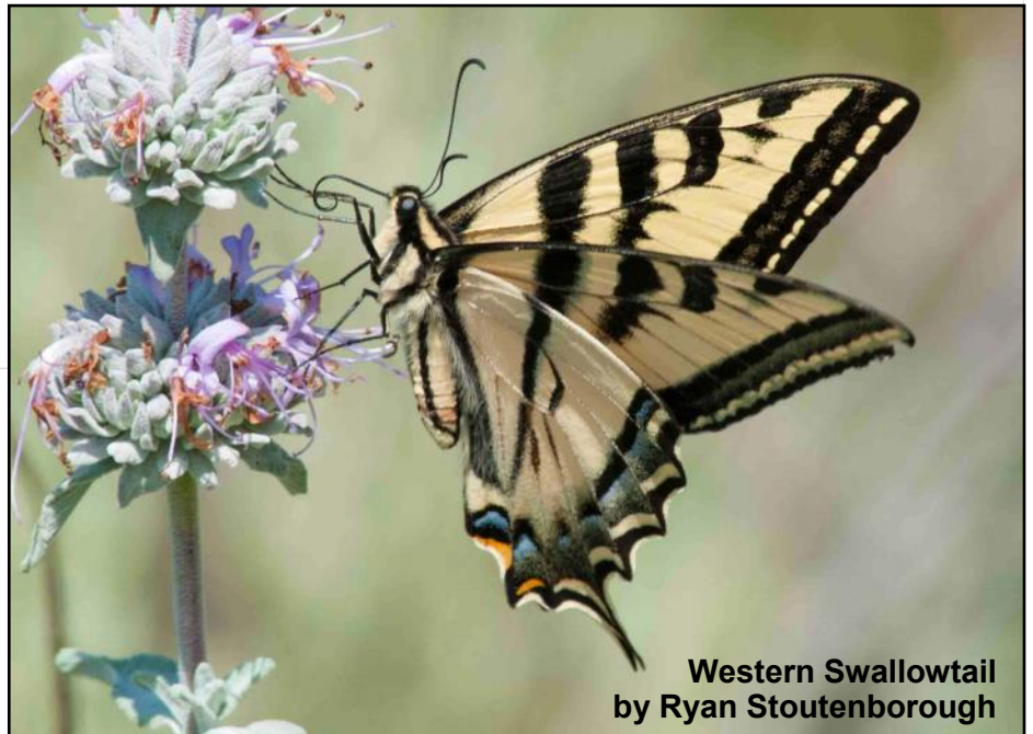
Western Swallowtail by Ryan Stoutenborough

If you are interested, see the guidelines and apply online at: www.ConejoValleyAudubon.org