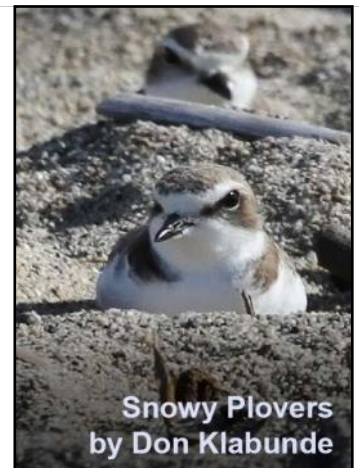
Snowy Plovers